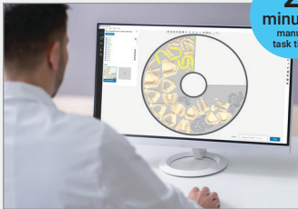
Automated nesting and support placement