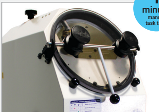
Automated support removal, no IPA, no additional curing