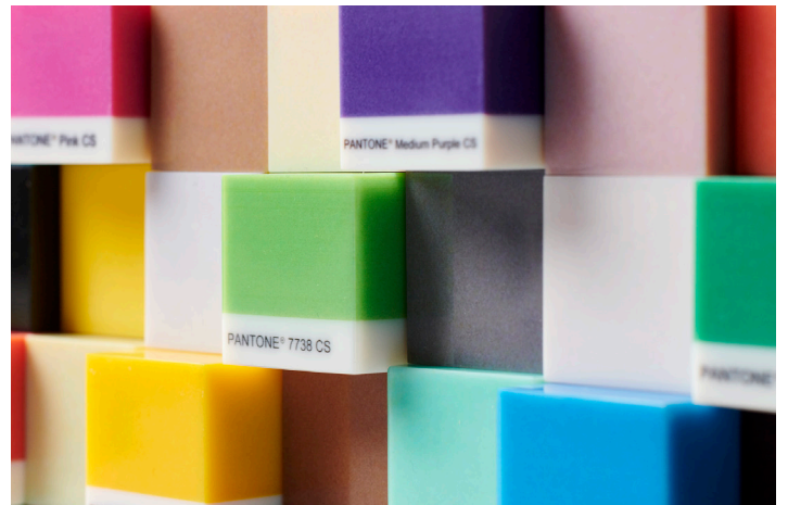
Pantone color blocks