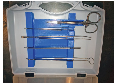
This blue 3D printed tray was custom-created to accommodate the size and shape of these surgical tools.