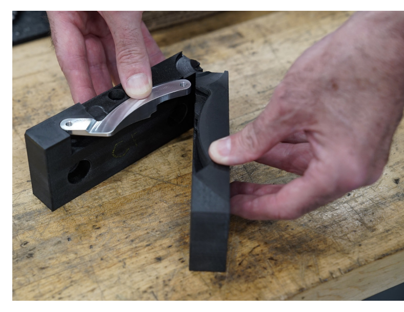
3D printed soft jaw tooling can be produced overnight, ready for use the next day.

Another application includes 3D printed surrogate parts. Some sub-assemblies East/ West makes must fit with parts located off-site at the customer's facility. Vetter's team 3D prints stand-ins for those mating parts using customer-supplied CAD data. This ensures East/West's parts fit perfectly with the customer's assembly. "First-time quality is critical to our customers. Being able to inspect the parts to ensure they're going to work 100% when they go out the door is a huge benefit for our customers and East/ West," says Vetter. It also shows customers how East/West invests in forward-leaning technology like additive manufacturing to meet their needs.