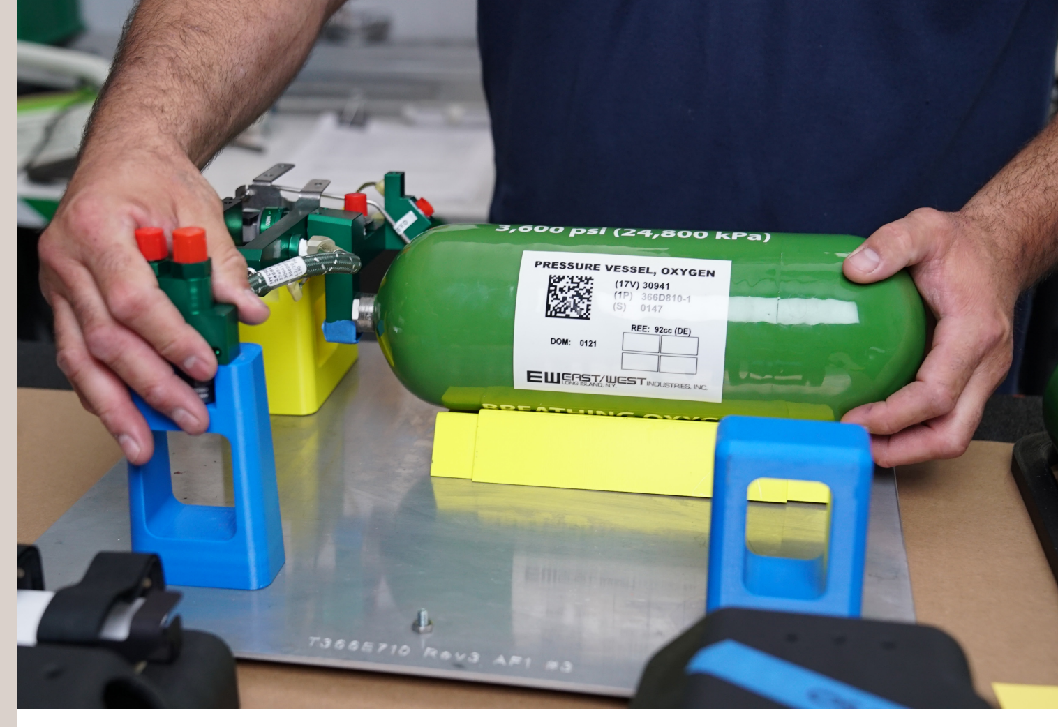
East/West Industries leverages additive manufacturing for multiple uses, helping increase production efficiency and reduce cost.