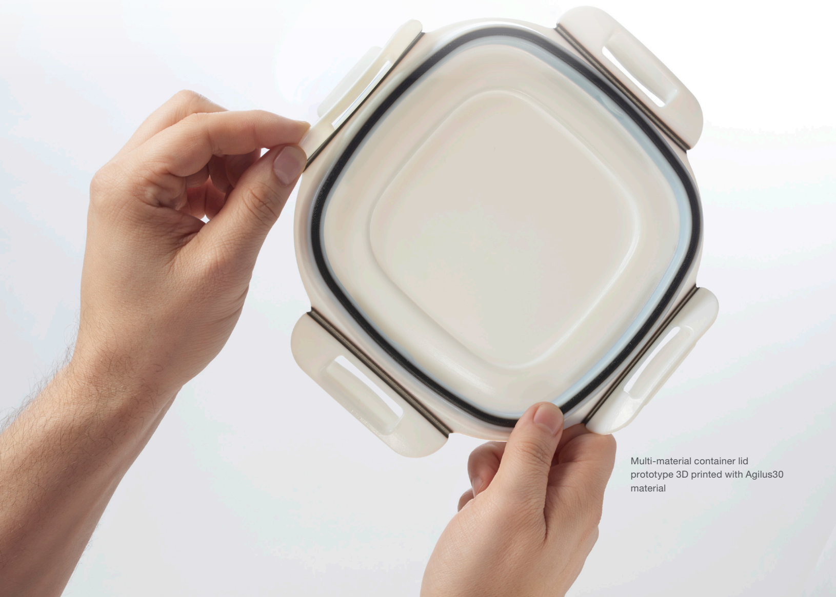
Multi-material container lid prototype 3D printed with Agilus30 material

And if you need full color capabilities down the line, the J850 Pro can easily be upgraded into J850™ Prime .