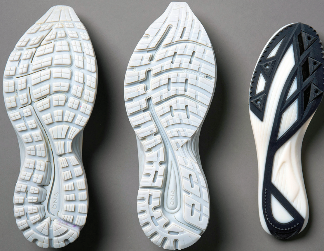
3D printed shoe midsole and outsole prototypes created by Brooks Running