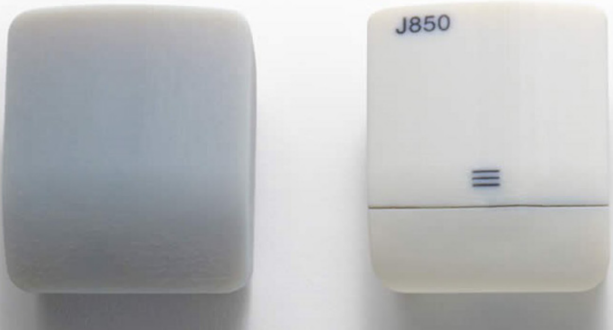
Earbud case prototypes 3D printed with DraftGrey™ (left) and VeroPureWhite™ (right)