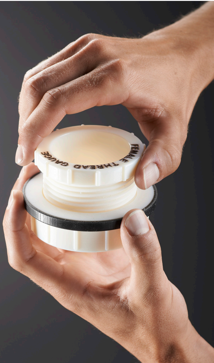
Threaded gauge prototype with male and female components

With speed, accuracy and repeatability, the J850 Pro is the most versatile rapid prototyping solution for design engineering applications today. Visualize and verify designs with a flexible in-house system, and meet business demands immediately and with ease.