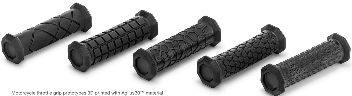
Motorcycle throttle grip prototypes 3D printed with Agilus30™ material

With the J850 Pro, it's simple to create functional, multi-material models that let you test and validate prototypes faster, and move through stakeholder review with ease. This leads to quicker decisions and approvals, helping you achieve product verification, increase throughput and save valuable time.