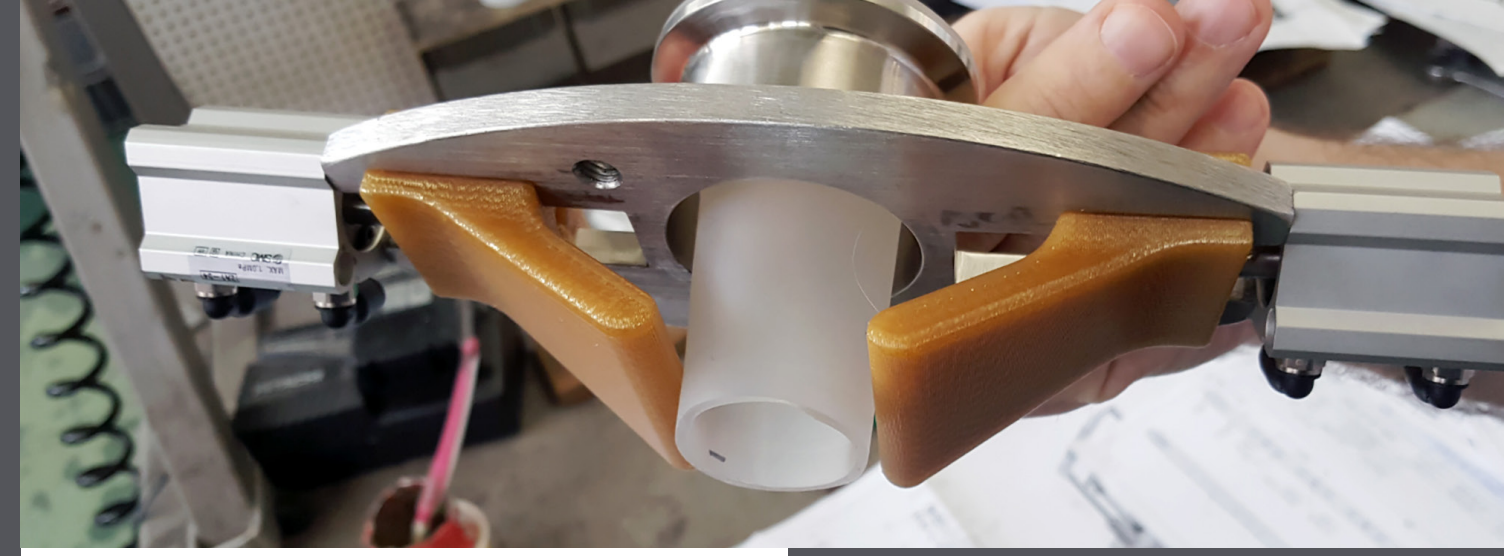
The final 3D printed machine replacement part produced using the Fortus 450mc 3D Printer.