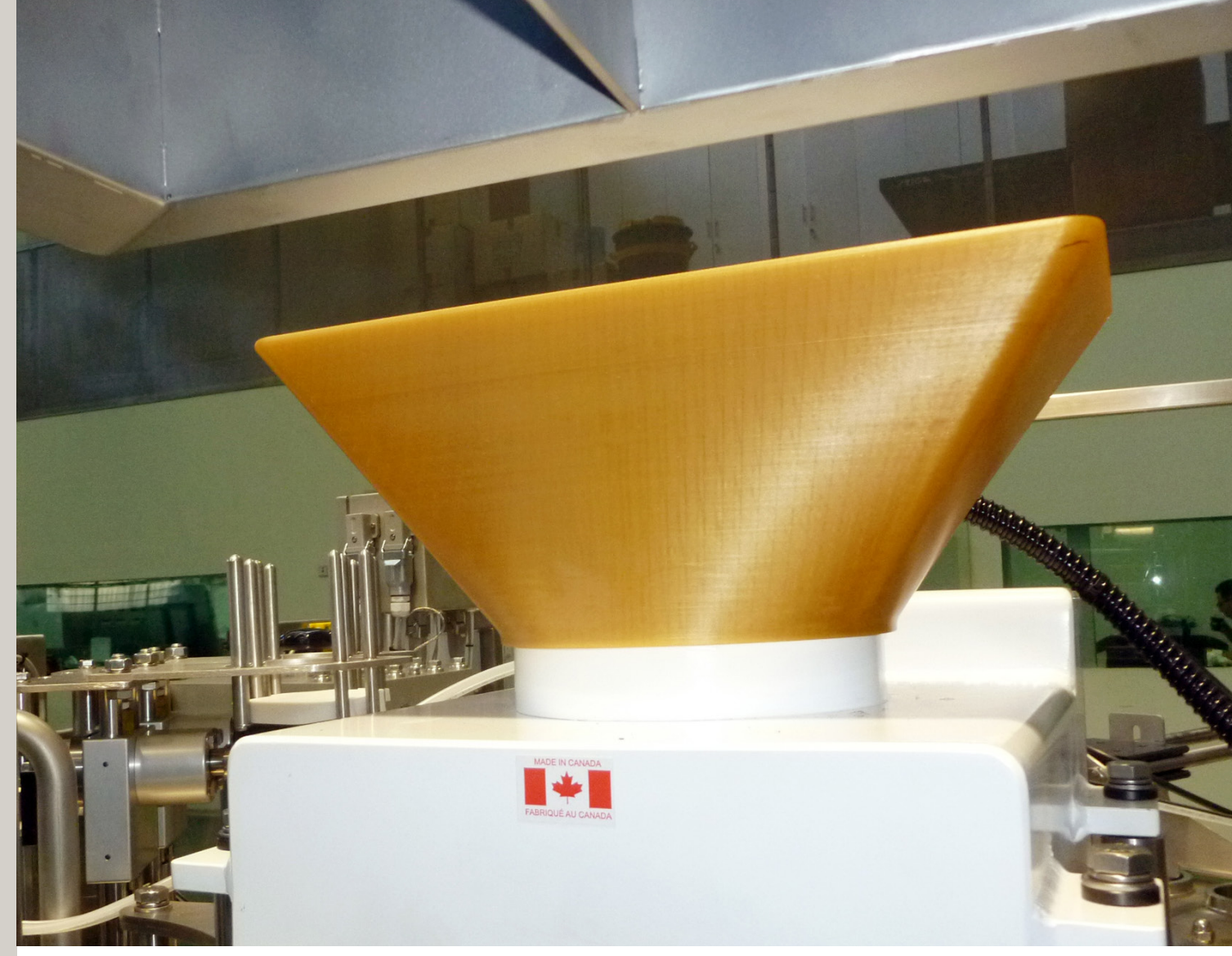
This 3D printed food packaging machine replacement part was 3D printed in ULTEM™ 1010 resin material on the Fortus 450mc 3D Printer.