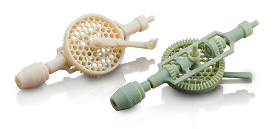
Figure 5: This hand-powered drill features moving gears, screw-fits, pressure inserts for handles and moving parts. Complex geometries, interlocking gears and functional use parts are made possible by the accuracy and tolerance Digital ABS Plus .

The toughness of the Digital ABS Plus material makes it ideal for prototypes and parts featuring repeated flexing and bending, such as clips and fasteners.