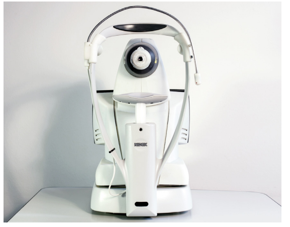
Figure 3: The external case of Nidek's prototype Gonioscope® was built on a Connex3 3D Printer.

Nidek Technologies (Nidek), an ophthalmological device manufacturer, found the Connex3 optimized their rapid prototyping process, and as a result, accelerated the clinical validation of their ophthalmological diagnostic systems. All of Nidek's products have direct contact with patients, so it's crucial to produce fully-functional prototypes that precisely replicate the final product. The Connex3 enables Nidek to perform a comprehensive evaluation of fit, form and function before moving to final production, significantly cutting the time it takes to get the products to market.