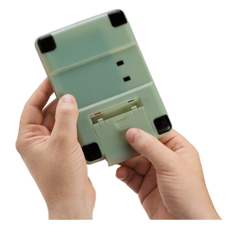
Figure 11: This electronic device uses Aglius30 for the rubber-like, over-molded anti-slip surfaces. The battery compartment cover features functional snap-fit clips.