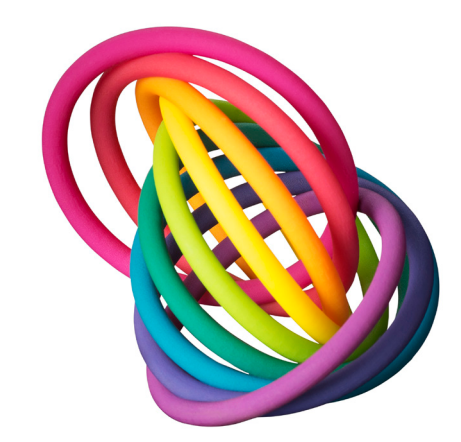
Figure 9: These interlocking color rings were 3D printed in one job using the cyan-magenta-yellow palette.