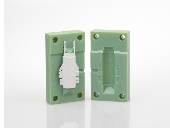
Figure 7: Digital ABS \ensuremath{\textit{Plus}} on the Connex3 builds tough injection molds fast for Turck.

Digital ABS Plus on the Connex3 met Turck's challenge. With the technology in house, Turck produces prototypes for overmolded products in just a few days after completing the design,