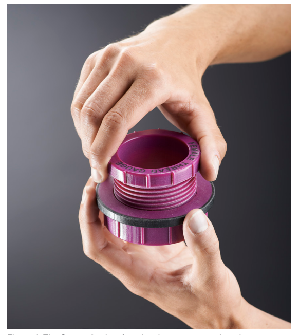
Figure 4: The Connex3 prints functional prototypes and ready-to-use models in an array of eye-popping colors.