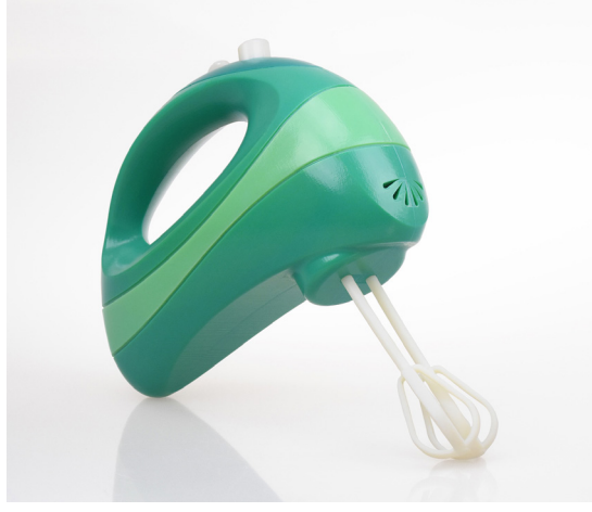
Figure 1: The cyan-yellow-white palette produced this hand-mixer prototype.

Connex3 combines three base materials and offers an expansive material selection and rich, vibrant colors. Connex3 technology is available in three build tray sizes and supports any three materials from the five base colors — white, black, cyan, magenta and yellow — as well as hundreds of Digital Material<sup>™</sup> combinations. The striking blended color palettes and versatile material combinations make it possible to print realistic prototypes with speed and accuracy.