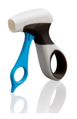
Figure 12. This surgical prototype also features Digital ABS Plus and black Agilus30 overmolding for superior grip, and a 3D printed color handle, printed separately.

Connex3 provides the capability of not only using three materials in the same part, but also creating composite materials from three base resins. Users are able to blend the strength of Digital ABS Plus and also achieve a range of Shore A values into one component.