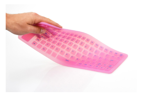
Figure 10: The Connex3 3D printed this colorful, flexible keyboard in one job by combining clear rubber-like material with magenta.

Figure 9: These interlocking color rings were 3D printed in one job using the cyan-magenta-yellow palette.