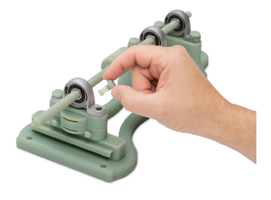
Figure 6: This flexible motor shaft coupler demonstrates the ability of Digital ABS Plus to allow end movement without breaking. Small metal clips are attached to jig base.