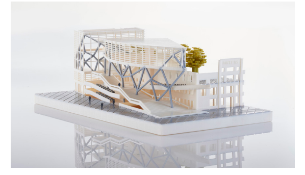
Figure 15: This architectural model was printed with Vero PureWhite using SUP706 soluble support.

SUP706 is hands-free and ideal for cleaning complex geometries such as tunnels and holes or small, delicate parts that cannot withstand WaterJet pressure. This is another way Connex3 provides flexibility to accomplish diverse tasks with one system.