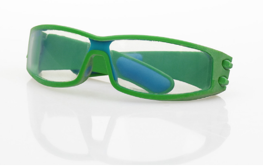
Figure 8: Connex3 allows for blending color and clear for translucent lenses.

With the third material, Connex3 can 3D print parts using Digital ABS Plus (or another Digital Material) plus one other, dissimilar material. Rubber overmolded parts with Digital ABS Plus are possible, or the third material means Digital ABS Plus can be combined with color accents or clear features.