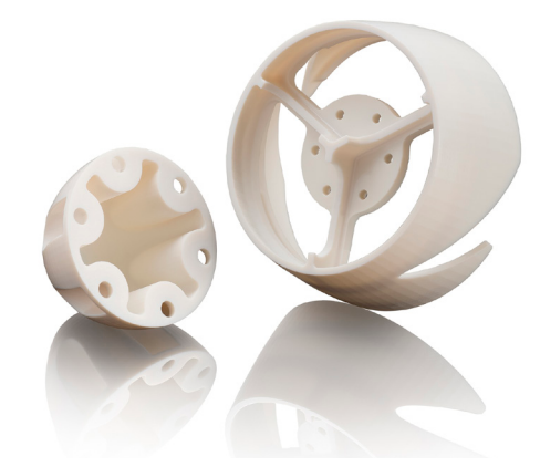
Figure 2: This functional propeller cone assembly in Digital ABS Plus features smooth, cone-shaped surfaces and bolt assemblies.

Connex3 can build as many as 82 material characteristics into an individual part, assembly or multi-part job. The wide range of material properties, colors and opacities create readyto-use models ideal for rapid prototyping, because it eliminates secondary operations such as assembly and painting, all while delivering the speed, precision and resolution of PolyJet technology. Prototypes featuring smooth, curved surfaces with minimal 'stepping' effect are enabled by 16-micron layer printing.