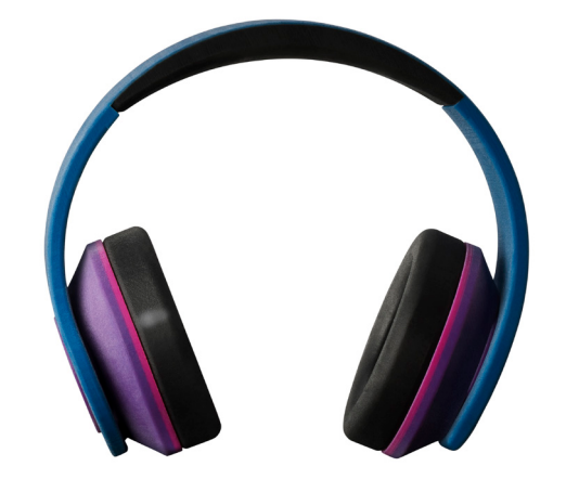
Figure 16: This 3D printed prototype was built in one job with rigid cyan, rigid magenta and black rubber-like materials, offering a range of as many as 68 colors and dark shades from blue to purple to magenta, plus flexible rubber-like components in black.

jump-start a multi-color, multi-material 3D printing operation, here are some of their recommendations.