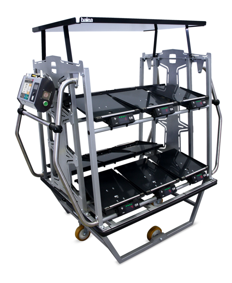
Balea trolley equipped with electronic weighing systems to load the right amount of goods during preparation of orders.

"Our workflow efficiency is also given a boost by the GrabCAD Print software that is loaded on the printer. This lets us print straight from CAD files, which saves an enormous amount of time. Overall, we have accelerated the whole design cycle — from the design itself, to the decision-making, testing and final-part manufacturing."