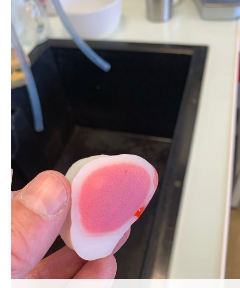
The J5 MediJet's multi-material multi-color 3D printing capability enables the production of ultra-realistic models for pre-surgery preparation and training

The short-comings in the hospital's existing alternative technologies also meant that the production of some models had to previously be out-sourced to external providers. Nevertheless, with a level of quality that fell short of the hospital's requirements, together with a mounting need to better manage increasing volumes, the acquisition of the in-house J5 MediJet made logical business sense.